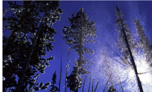
December 2018: O Christmas Tree, O Christmas Tree, How Sustainable Are Thy Branches? A Spirited Exploration of the Environmental Trade-Offs Between Real vs. Artificial Winter Holiday Decorations!