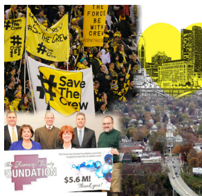
May 2019: Building Relationships to Increase Prosperity and Well-Being in Ohio Communities