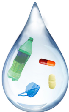
March 2019: Emerging Contaminants and Our Water Resources