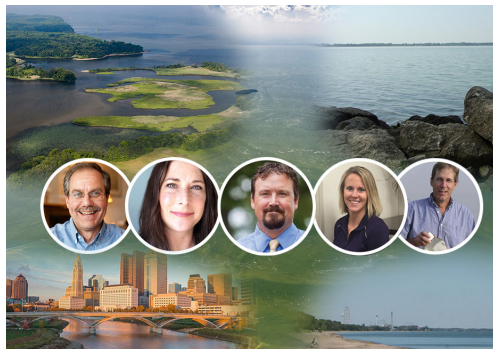
September 2018: The Lake Erie Impairment Designation- What Does it Mean and What Can We Learn From Other Watersheds?