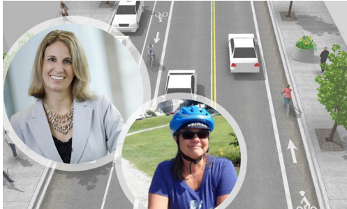
November 2018: Let's Make Biking Work! An Integrated Transportation Approach to the First and Last Mile of Your Daily Commute