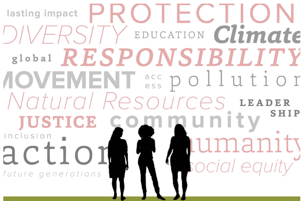
April 2019 Signature Event: Women in Conservation- A Conversation with Frances Beinecke and Michelle DePass