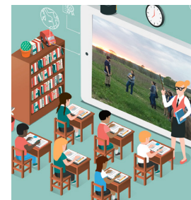
July 2019: Environmental Careers, Curriculum, and Collaborations