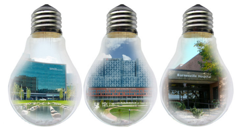
October 2018: Healthy Planet, Healthy Patients- Hospitals Reduce Their Environmental Footprint