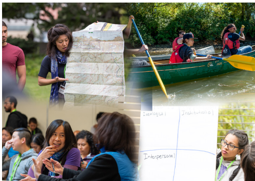
February 2019: Justice, Equity, Diversity, Inclusion in the Environmental Movement