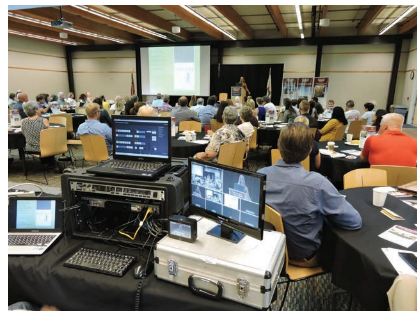
EPN Breakfasts are recorded and available from the EPN website. These archived streams are online at http://epn.osu.edu/about-epn/events/archive .