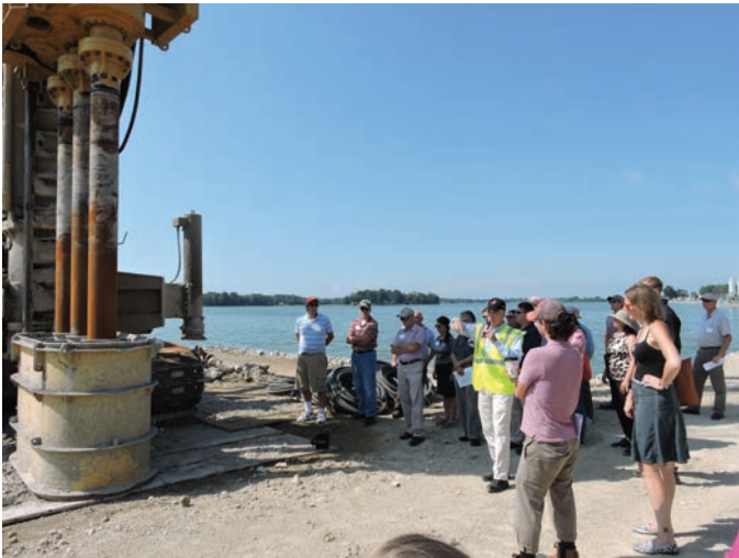
In July, participants heard about Buckeye Lake.