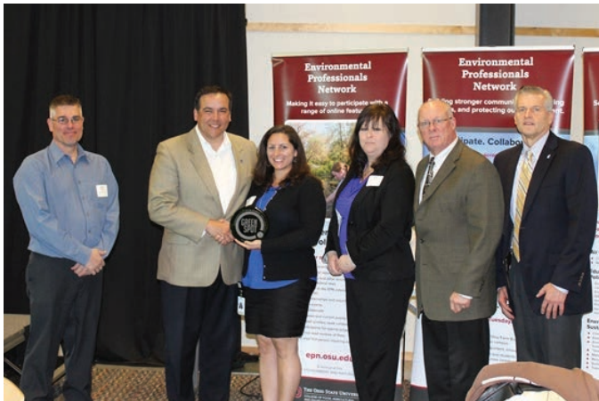
Columbus Mayor Ginter presents the GreenSpotLight 2016 awards at the April EPN Breakfast.

SCHOOL OF ENVIRONMENT AND NATURAL RESOURCES